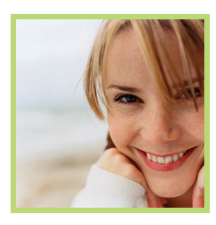
Protect Your Smile . . . and Smile Brighter!